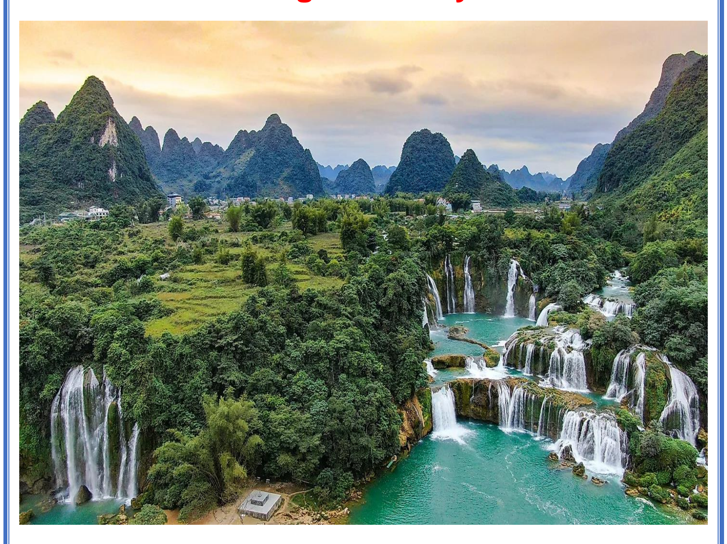
Day 1 – Arrive Hanoi – Half Day city tour of Hanoi (SIC basis)

Welcome to Hanoi, the capital city of Vietnam.